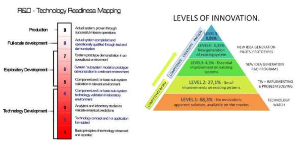
Figure 2. Innovation and TRL levels when communicating ERs